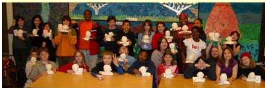
Children with their composers' busts and friezes.