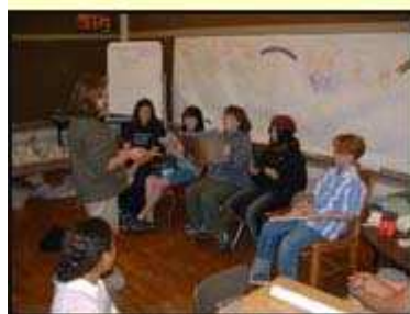
The children are introduced to the instruments.

The students were introduced to the six instruments for which they would be composing. The ensemble musicians demonstrated their instruments and talked about the information composers need to have when writing for them. They then performed the teachers' composition, "She Who Watches," and explained the composition process the students would use.