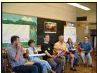
MLC teachers playing their soundscape.

We selected the legend of Tsagalala, the guardian of the Gorge, as the source of inspiration for a teachers' composition. Taking the teachers through the compositional process strengthened the project in several ways: it allowed us to test and pilot the process we would use with the students, it provided the teachers with an understanding of composition that allowed them to help facilitate our classroom work with the students, and it was an important