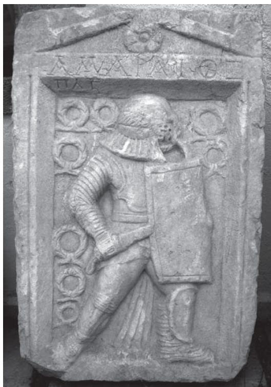
Stele of Amaraïos