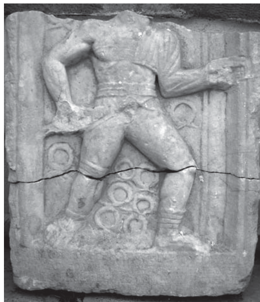
Stele of Eumelos