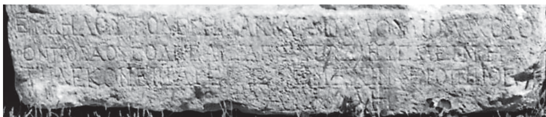
Stele of Eumelos: inscription on the bottom

The top of the stele is broken. Preserved height: 71 cms, width: 64 cms, thickness: 15 cms, height of letters: 2–3 cms. The gladiator is depicted in 3/4 profile to the left. Eumelos has nine garlands and he is a retiarius .