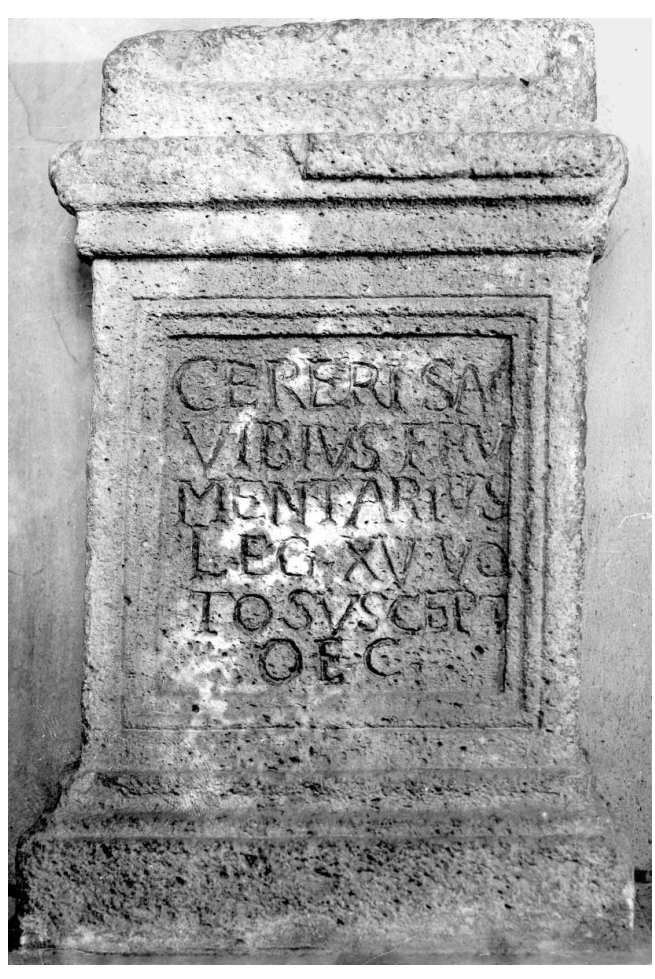
CIL III 10769 from Emona