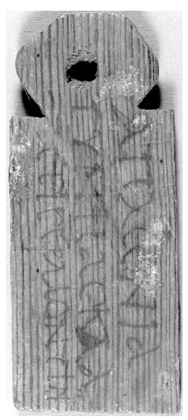
Mummy Tag, inv. N 2004