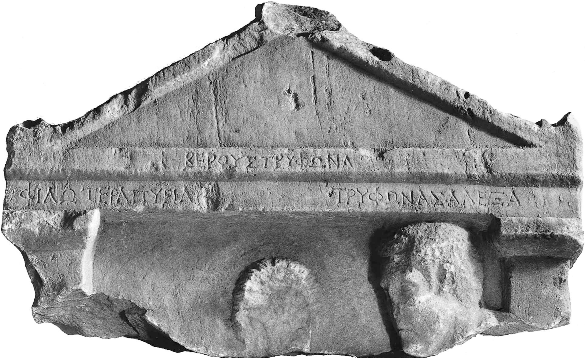
An Atticizing Stele from Western Crete