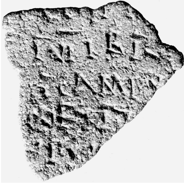
No. 5 extrinsecus