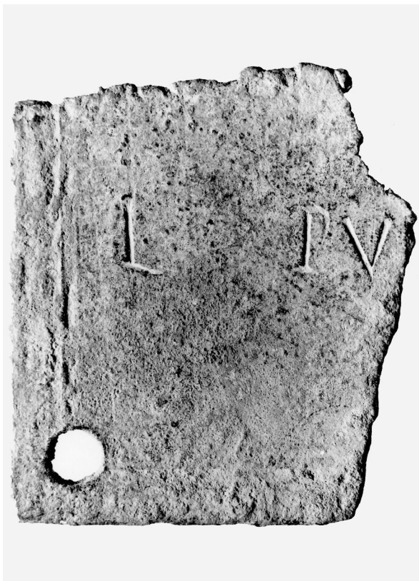
No. 1 extrinsecus