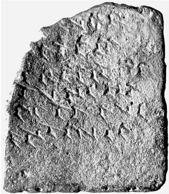
No. 6 extrinsecus