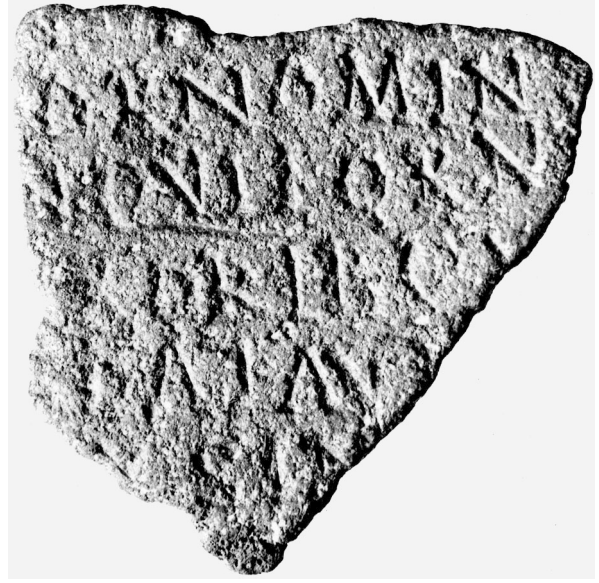
No. 5 intus