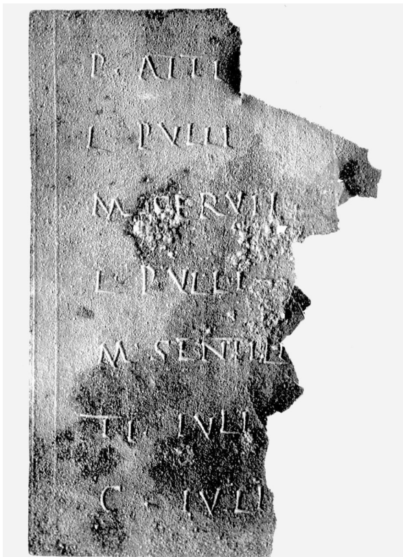
No. 2 extrinsecus