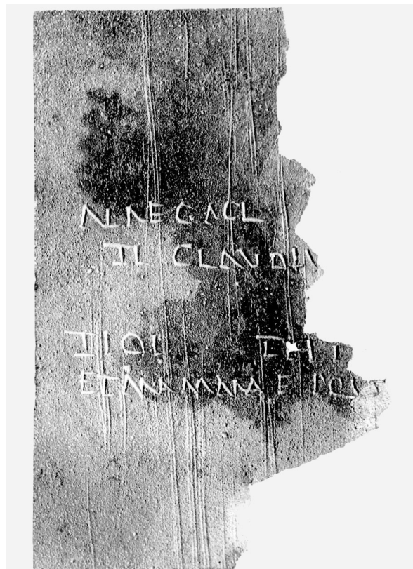
No. 2 intus