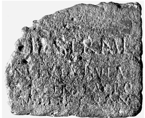
No. 6 intus

New Fragments of Military Diplomas from Viminacium; M. Mirković, pp. 249–254