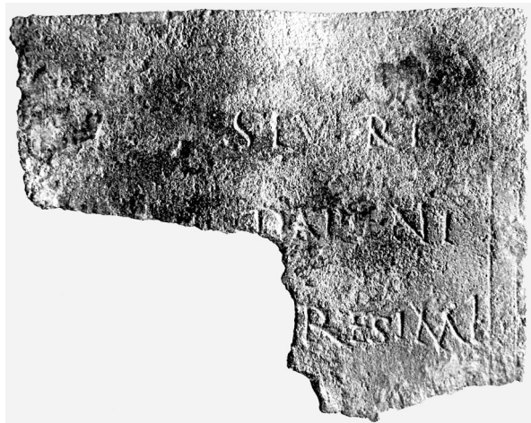
No. 3 extrinsecus