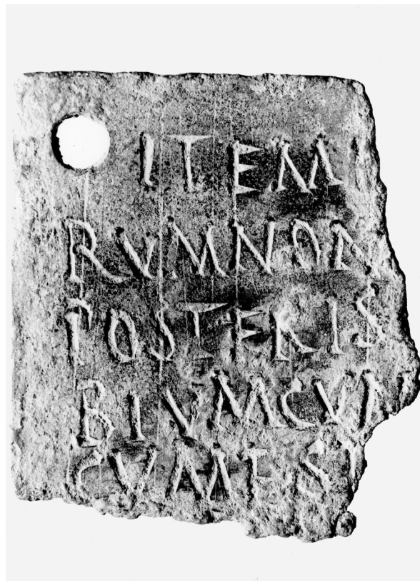
No. 1 intus